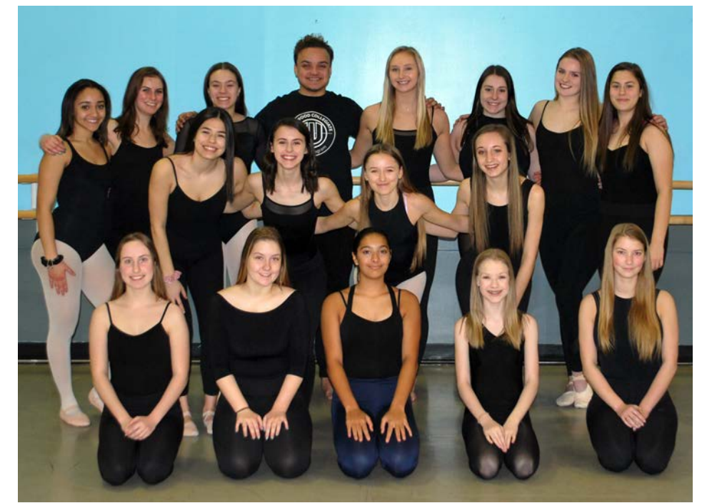
Dance advanced students in the Garnet and Peridot tribes preparing to present a student-led showcase in support of the Movement Centre of Manitoba.

The Movement Centre of Manitoba is committed to helping people maximize their independence by, much like the dance studio, providing an