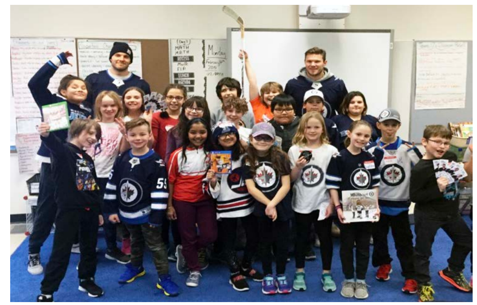
Winnipeg Jets stop by Lakewood School as part of the Reading Takes Flight Program, in honour of "I Love to Read" month.