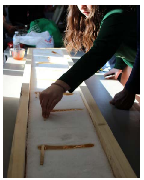
Rolling maple syrup sticks during John Taylor Collegiate's Festival du Voyageur event hosted by the Piper Cafe team.

To provide a more recent example, the Piper Café hosted a Festival du Voyageur event where French and Indigenous cultural perspectives were enjoyed by all. The event offered various entry points for students so they were never pressured to attend a certain station or be somewhere at a certain time. Every station was supported by staff and students and it was open to all without a cost or prior commitment.