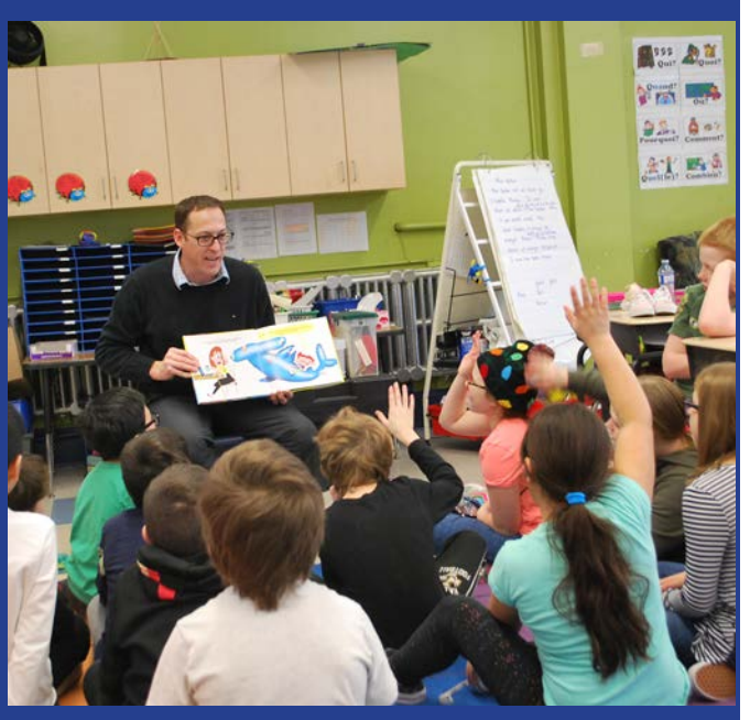
A snapshot of "I Love to Read" month 2019 Page 6