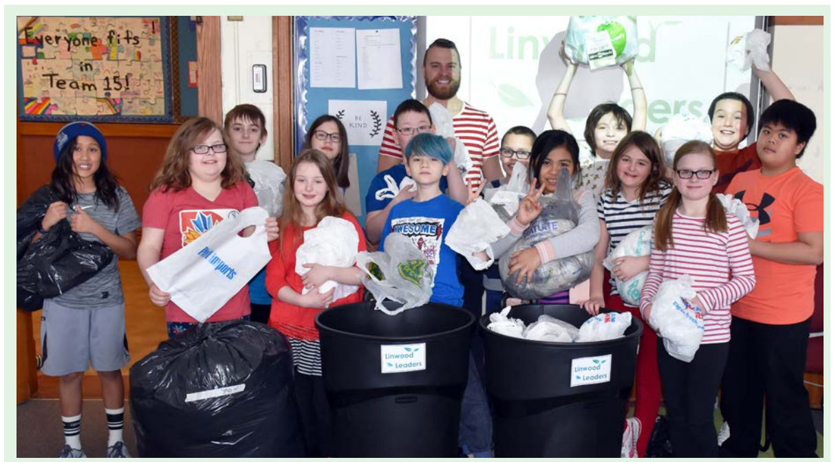
Linwood Leaders in Room 15 counting the number of plastic bags they've received to date.