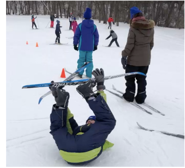
Lakewood students taking part in the Ski at School program at Windsor Park Nordic Centre.